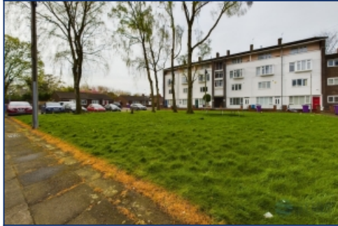
Front Communal Gardens