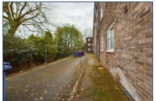
Back Communal Area