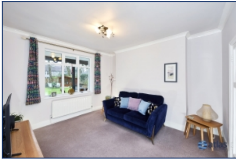
Second Living Room