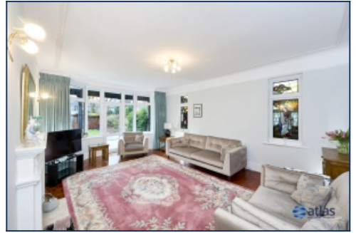
Front Living Room