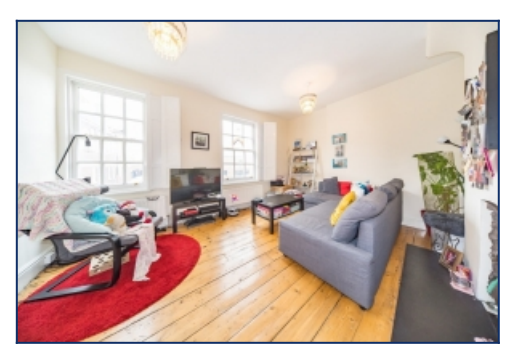
Bedroom (used As A Living Room)