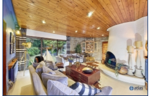
Main Reception Room