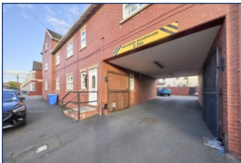
Back Communal Area