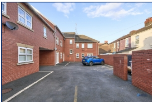
Back Communal Area