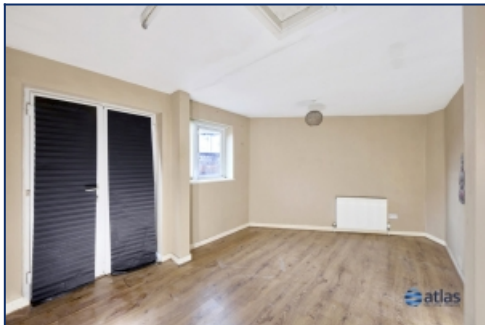
Reception Room 2