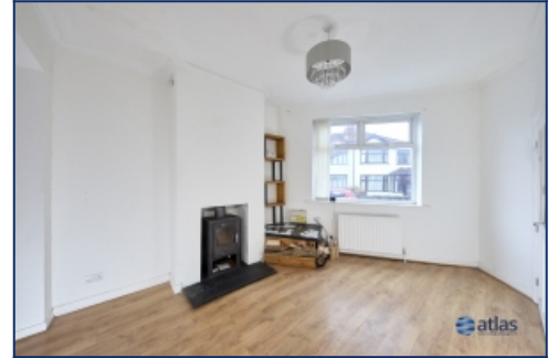
Reception Room 1