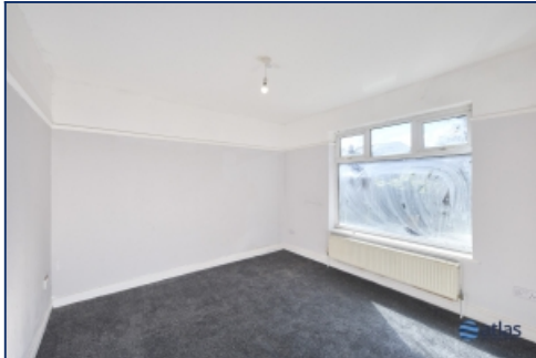
Back Reception Room