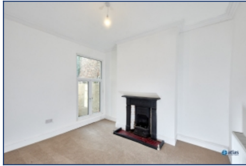
Reception / Dining Room