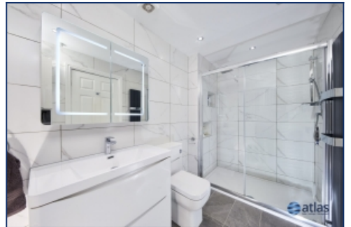
Bedroom 2 - En Suite