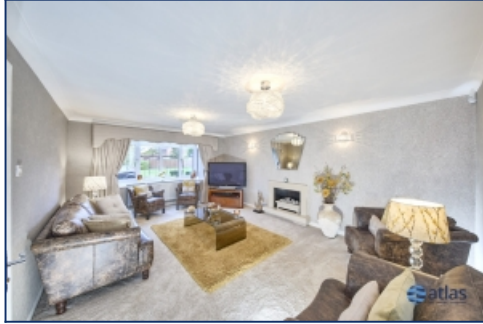
Front Reception Room