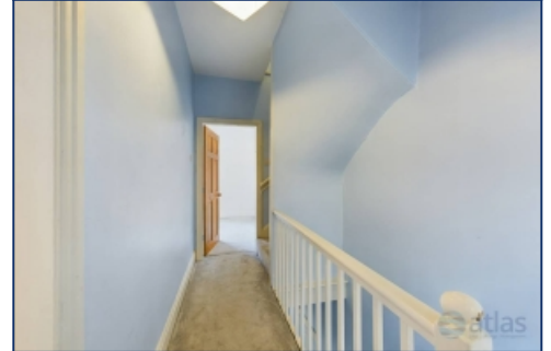
1st Floor Landing