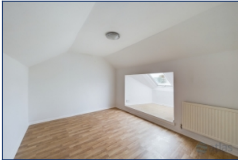
Top Floor Bedroom