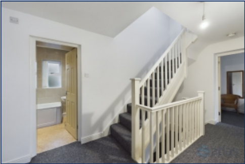
First Floor Landing

This residence stands as a testament to the Atlas Estate Agents' commitment to excellence, offering a haven of comfort, sophistication, and modernity. Don't miss the opportunity to call this spacious three-storey townhouse home where every detail is curated for an exceptional living experience!