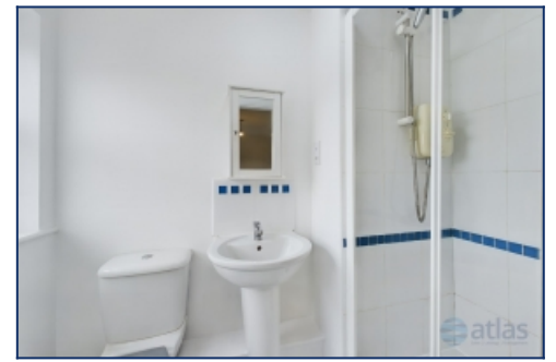
En Suite Shower Room